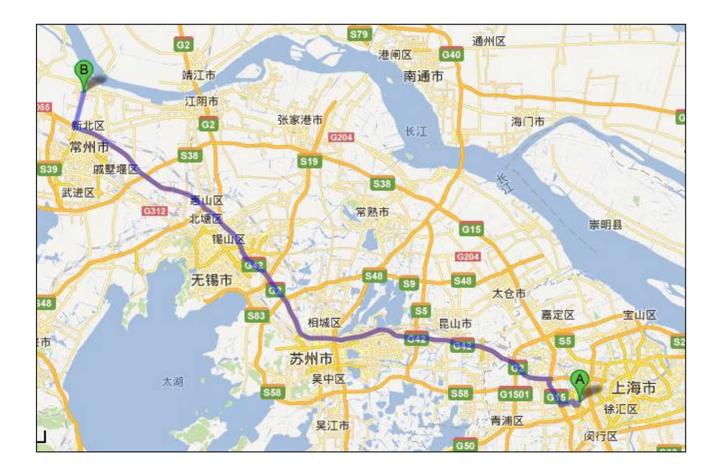
驶入 G42 沪蓉高速(南京方向)。下 薛家/常州港 出口,从常州港 方向驶入龙江北路,往北行驶约 8 公里,向左转,进入兴塘西路。工 厂入口将会在你的右边。